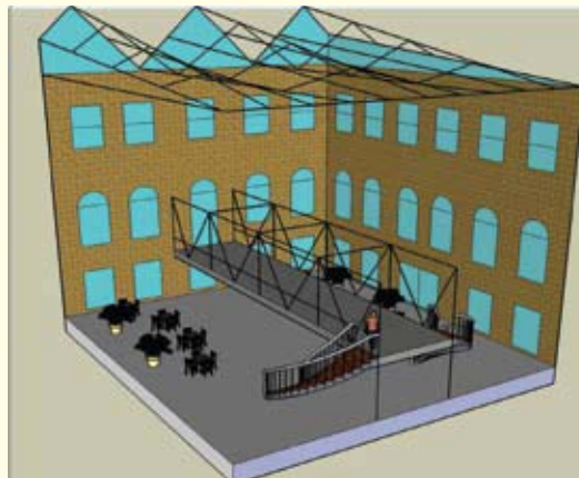
Civil engineering students created theoretical plans for the renovation of Gilman Hall, including this plan created by undergraduates Jesse Richter, Zach Rosswog, and Josh Hoagland.

In final presentations each of the five student groups had to solve a complex set of design criteria, which called for allocating space for a 1,500-square-foot lecture hall, creating mechanical space at or below the second floor level, preserving the existing bridge while adding north/south traffic flow to its east/west axis, and covering the final structure with a glass roof above the