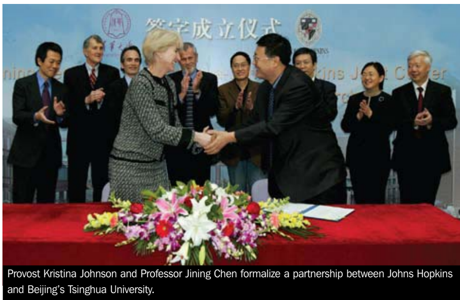
Provost Kristina Johnson and Professor Jining Chen formalize a partnership between Johns Hopkins and Beijing's Tsinghua University.

The symposium was co-hosted by the Whiting School and the Shanghai Jiao Tong University College of Life Science and Technology, after a partnership was formed between the two schools last May. Founded in 1896, Jiao Tong is one of the oldest universities in China, with over 200 of its alumni belonging